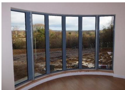
The view from the Larch Room