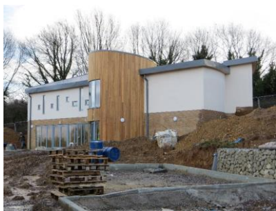
An early January external view