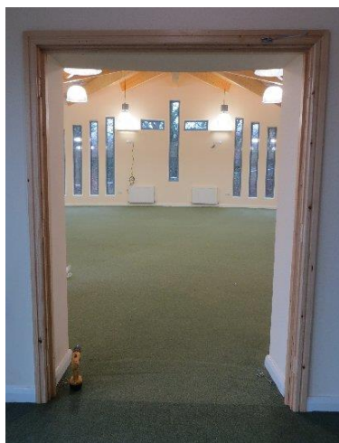
View from the Larch room into the Beech Room