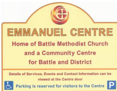
The Entrance sign board – to be erected.....