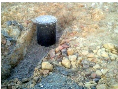
The 42 place car park takes shape and a very expensive but essential manhole