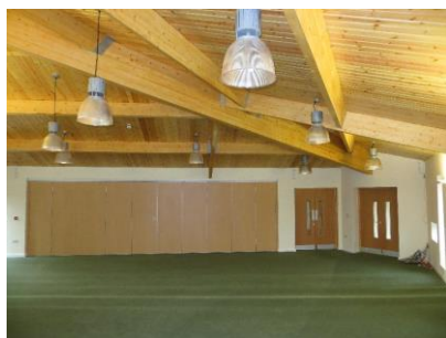
The Beech Room, showing the partition to the Sycamore Room

A site meeting was held to review progress and the earliest handover date then predicted was Friday 31st January.