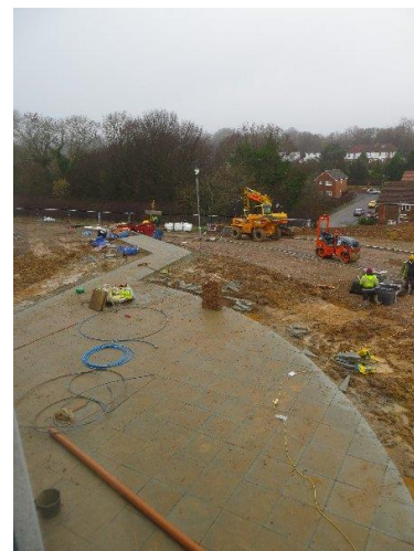
The patio and access path