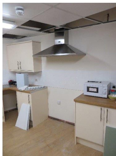
Cooker hood in situ