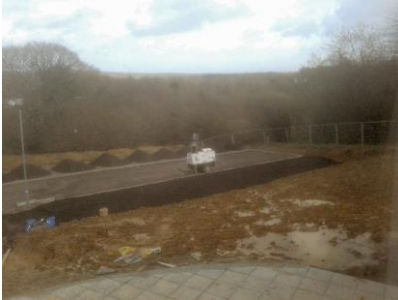
The car park – getting there- slowly

Not much new to photograph now.....The front sign post has been delivered, but will not be erected for a few weeks.