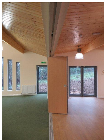
The Beech room L, the Sycamore room R

General work on the final road drains to soakaways and on the entrance is well in hand. It is just possible that tarmac will be laid towards the end of next week, dependent on progress and of course the weather.